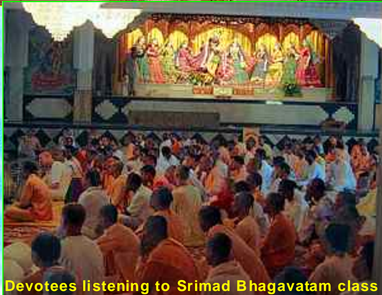
Devotees listening to Srimad Bhagavatam class

She is a very humble devotee, very fond of distributing Srila Prabhupada's books and preaching to the visitors. She always has some books with her and wherever she is going, she always tries to speak to people and get them to buy a book. She is also washing and ironing Srila Prabhupada's clothes daily.