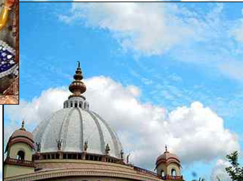
Srila Prabhupada's Samadhi Mandir