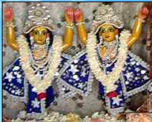
Gour-Nitai in Srila Prabhupada's Bhajan Kutir

FOUNDER-ACHARYA OF ISKCON HIS DIVINE GRACE A.C. BHAKTIVEDANTA SWAMI PRABHUPADA