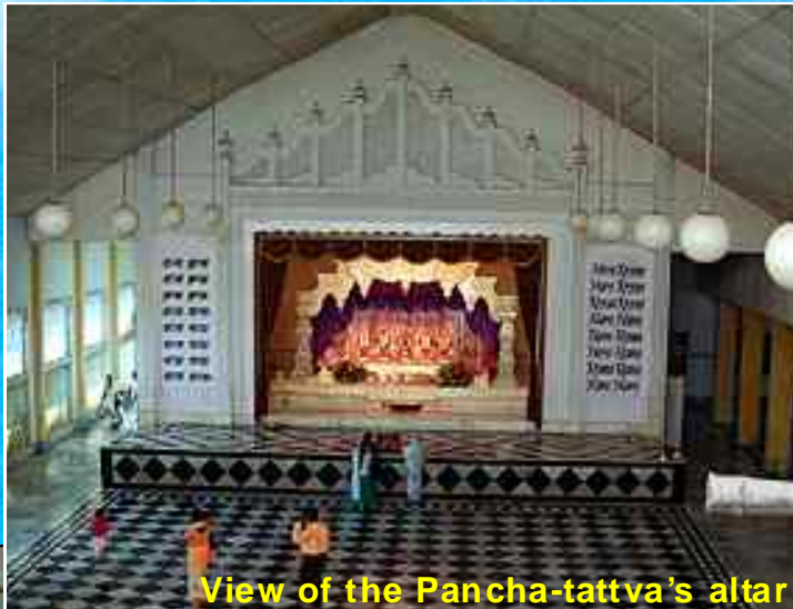
View of the Pancha-tattva's altar from the second floor of the new structure