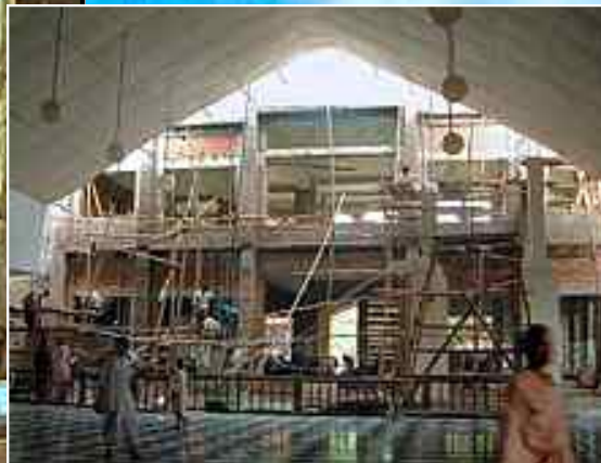
above and side:

The dividing wall between the temple room and the new structure is being ripped down.