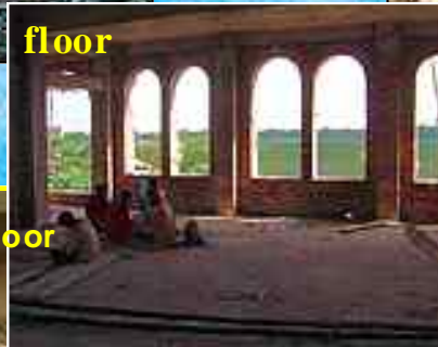
staircase leading to the 2nd floor