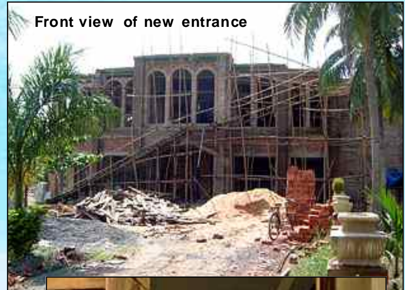
Front view of new entrance

The second floor will have a diorama display and the whole structure will be topped by five domes.