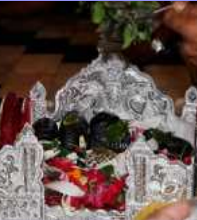
above: abhishek (bathing of silas) Balaram Silas on silver asan