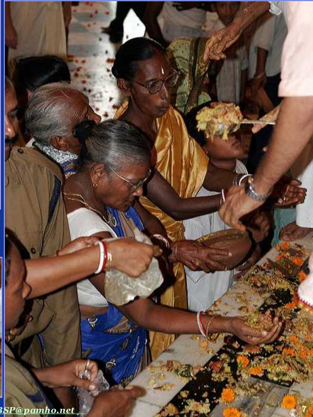
Maha-prasad distribution after the abhishek, pushpanjali and arotik