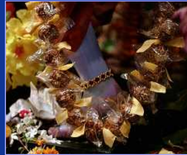
Krishna-Balaram are offered garlands of laddus made of puffed rice & gur.