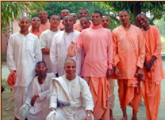
Mayapur Sankirtana devotes

During the months of September and October Sri Mayapur Chandrodaya Mandir distributed the following books: